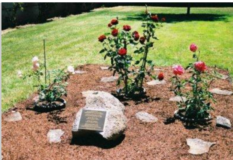
Memorial located at the Alameda District Office